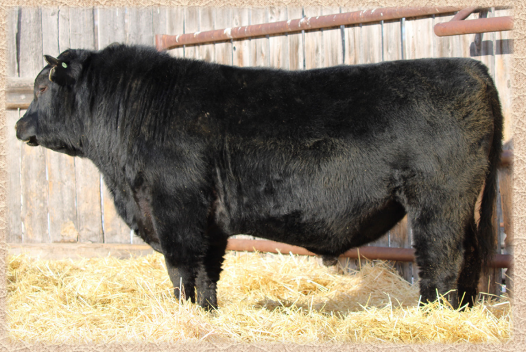
Lot 29 - FR MOMENTUM 19G