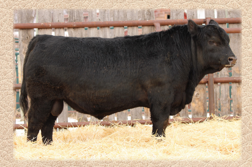
Lot 38 - FR CROSSFIRE 27G

He's well put together with a smooth profile, wide top, and lots of muscle. A very striking bull worthy of a long look.