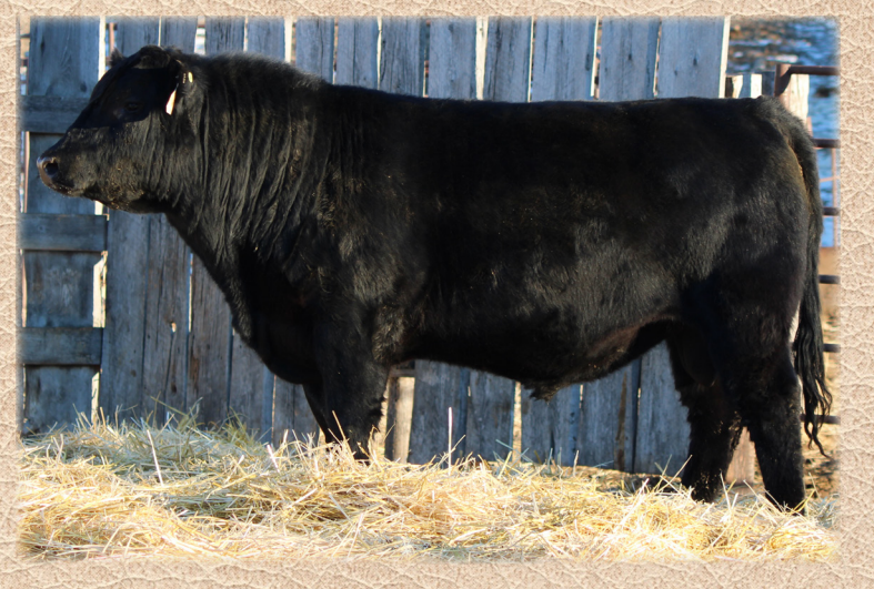
Lot 35 - FR CROSSFIRE 13G