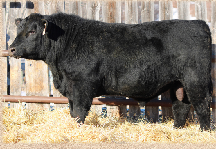
Lot 33 - FR MOMENTUM 40G

This solid bull won't be hard to find on sale day. Big framed and soggy. Good foot and leg structure.