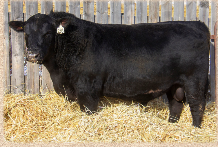
Lot 16 - JC CRAIG'S CORONA 28G