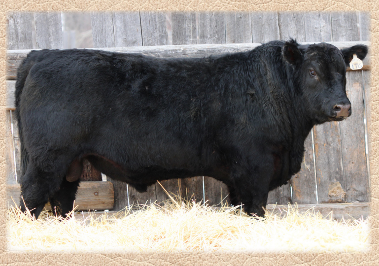
Lot 28 -FR MOMENTUM 17G

He is the largest framed bull in the offering. His length just stands him apart. Travels well on good feet and heavy bone.