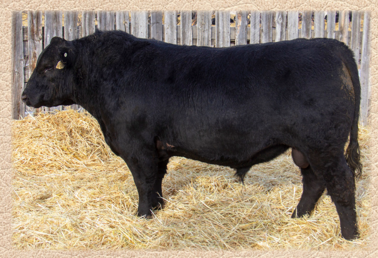
Lot 9 - JC CRAIG'S CORONA 10G