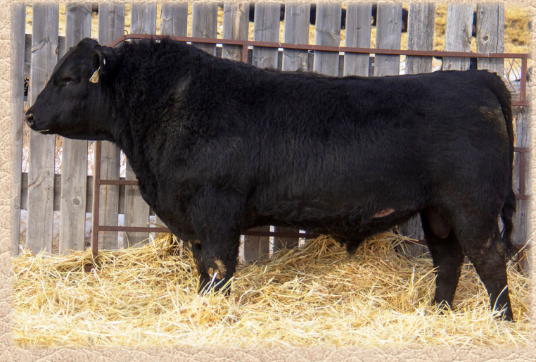
Lot 17 - JC CRAIG'S CORONA 31G