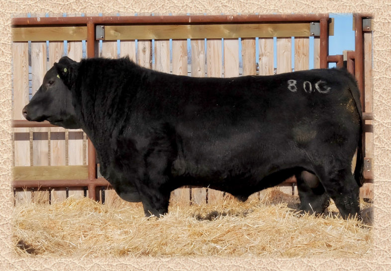
Lot 64 - BEAR CREAK STONEY 80G