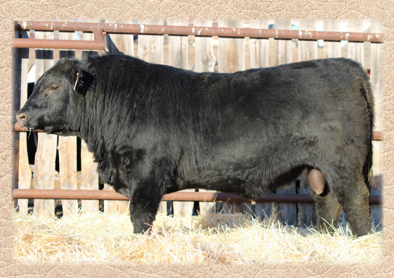
Lot 43 - FR COMPLETE 6G

This prospect has a masculine, stylish look. Good temperament, hair and movement.