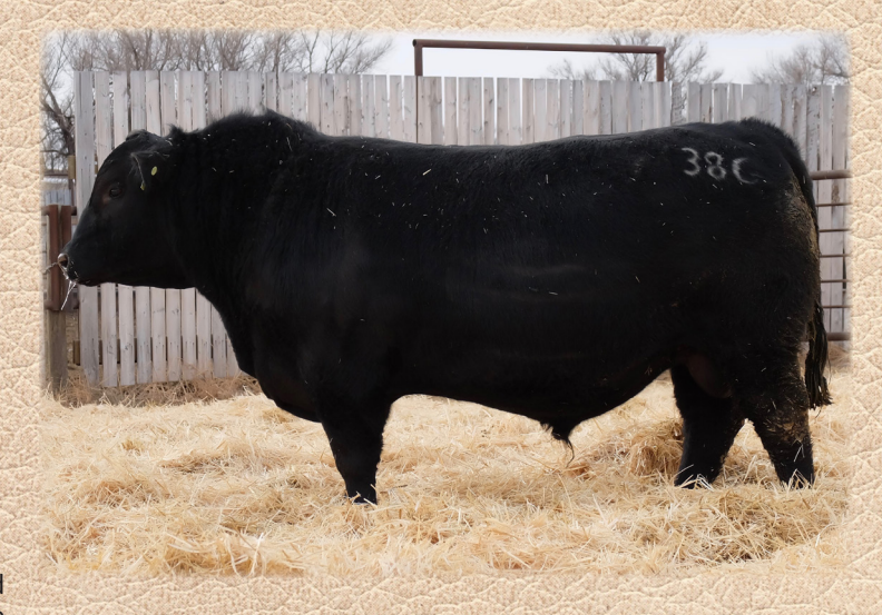
Lot 62 - BEAR CREAK ROCKNROLL 138G

This bull has so much to offer any program. He is long, big topped, and full of meat. He natural muscle has been second to none since the day he was weaned. He is off a tremendous cow that has never missed, whether it is a bull or heifer they have been at the front of the pen in quality.