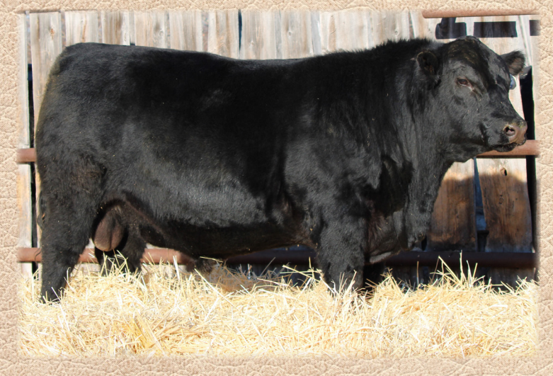
LOT 27 - FR MOMENTUM 7G

This bull is very similar to his sire. Thick, well proportioned, and quiet.