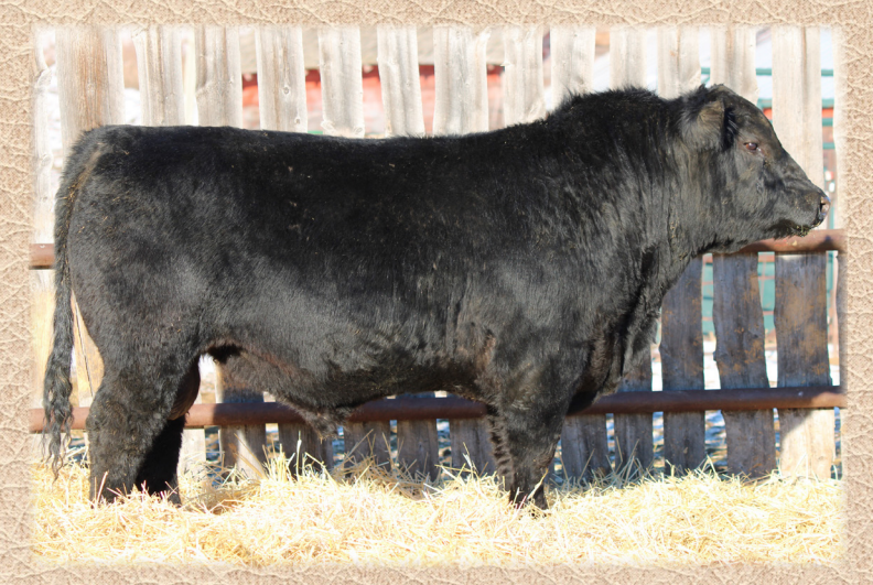
Lot 30 - FR MOMENTUM 23G

Here is a quality bull with extra length and capacity. Quiet disposition and a very moderate birthweight.