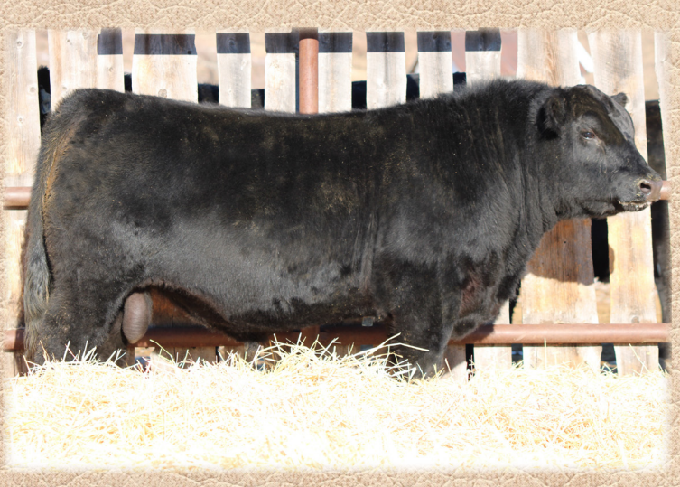
Lot 39 - FR CROSSFIRE 64G

Here is a standout bull that catches your eye. With square shoulders and hips this prospect fills out his frame. Excellent hair, stylish look, and a nice head.