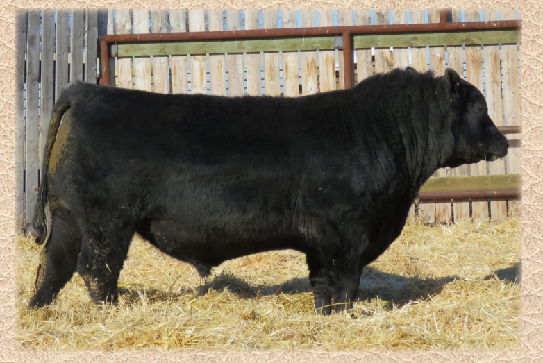
Lot 66 - BEAR CREEK STONEY 78G