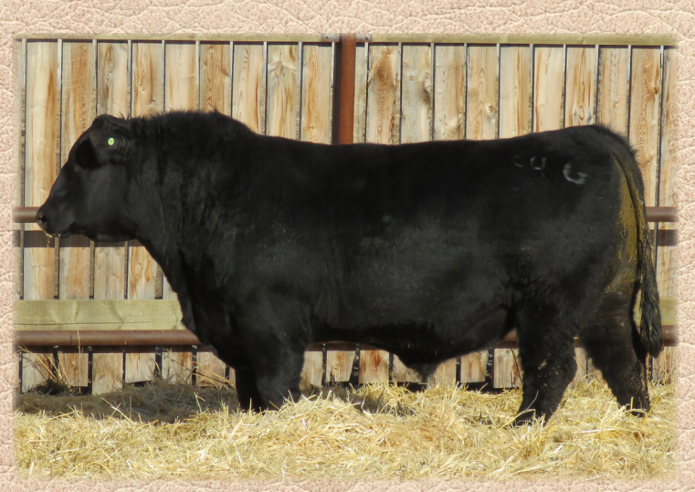
Lot 56 - BEAR CREEK JACKSON 94G

94A brings another strong one to the pen. She's another cow whose progeny are always near the top, with two maternal brothers going to Perrin Ranching 1990 LTD. She's one of those cows that everyone wants to be the mother of their next bull.