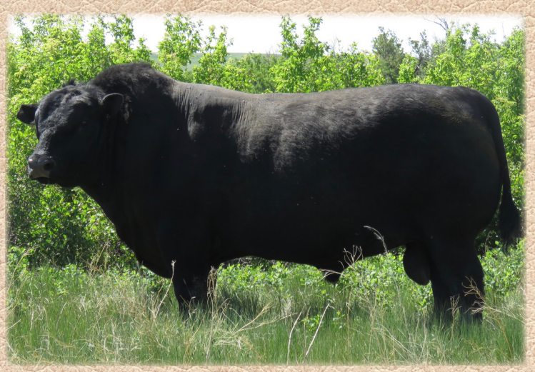
SIRE - MERIT STONEY CREEK 4023

We had high hopes when we purchased 'Stoney', and he exceeded all of them. His heifers are flat out amazing, the bull calves are the most consistent that we have raised. If you are looking for thick, hairy cattle to add spring of rib, and stick some meat on while doing it with moderate birth weights then Stoney sons are the bulls you need. It is amazing how theses bulls weigh up with their thickness and length. They are angus cattle through and through.