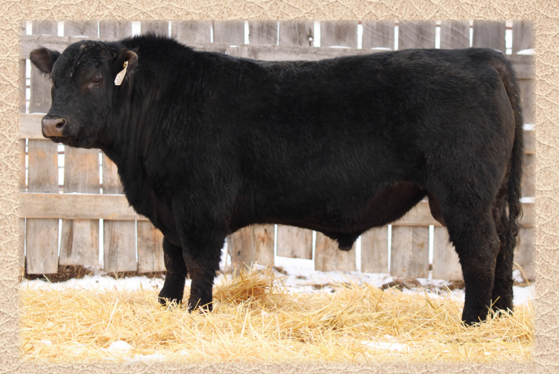
Lot 31 - FR MOMENTUM 31G

This guy is thick and deep with a nice hip and backline. A bull that has been very easy to be around.