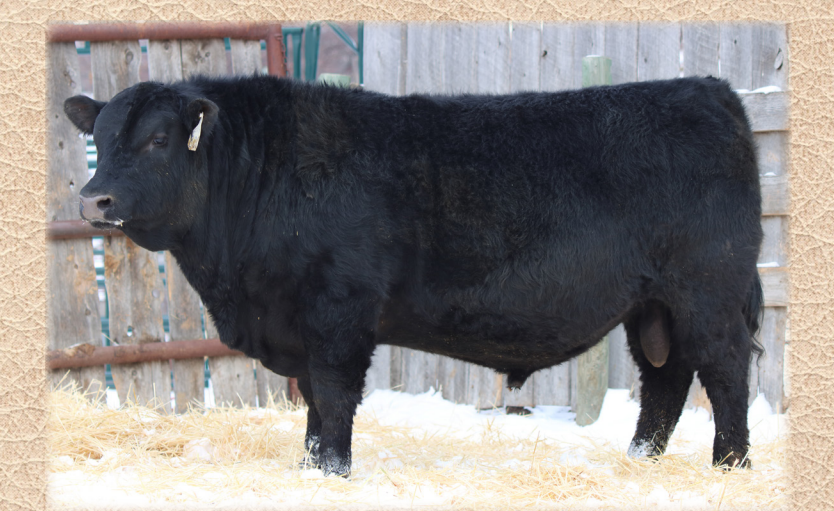
Lot 41 - CROSSFIRE 80G

He is just fancy. He has a very good topline, thick topped and muscled. A calving ease prospect with herd bull qualities.