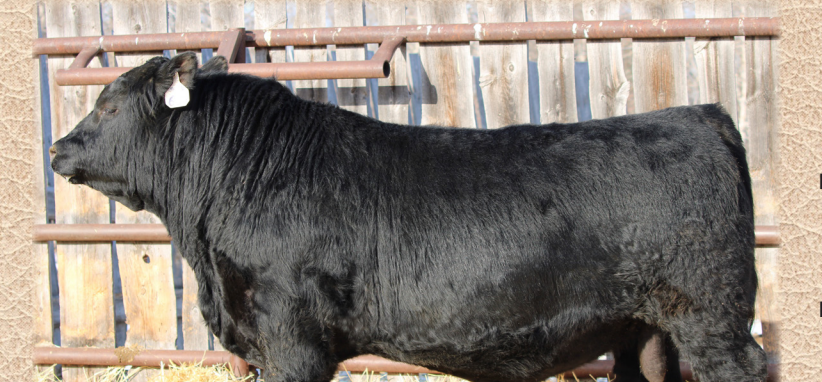
Lot 51 - FR COMPLETE 66G

He is one to check out with identical features to his sire and real standout dam with a perfect udder. Great hip and extra thickness.