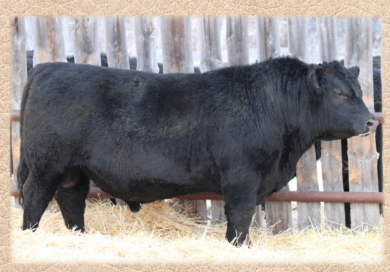
Lot 34 - FR MOMENTUM 90G

This tank of a bull is from 19S who has produced a lot of keepers over the years. Good length and frame with a big hip.