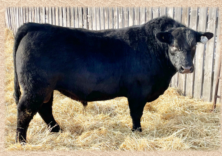
Lot 5 - JC CRAIG'S TENN X 57G