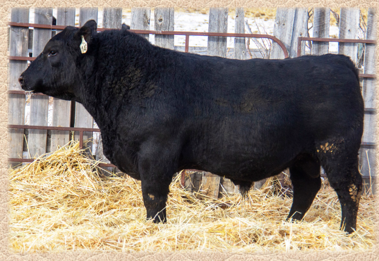
Lot 10 - JC CRAIG'S CORONA 14G