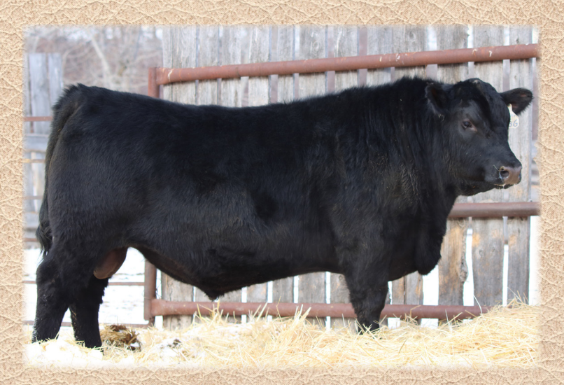
Lot 46 - FR COMPLETE 36G

He is a bull with lots of potential and great conformation. Stylish looking in a moderate frame.