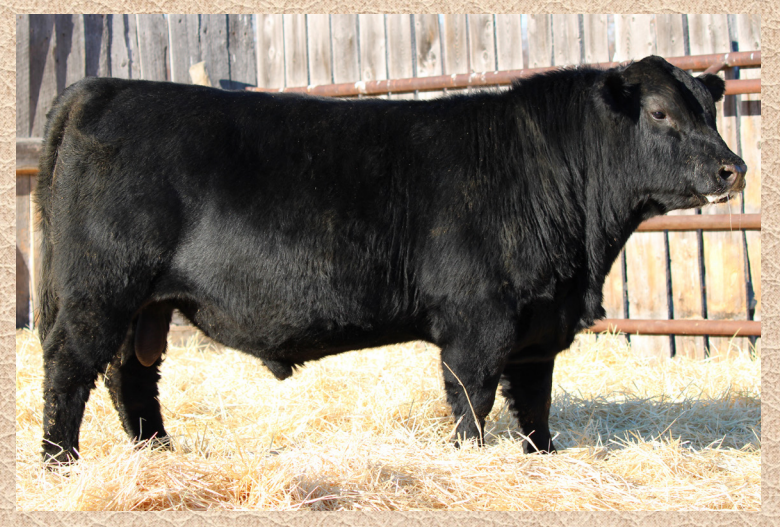
Lot 40 - FR CROSSFIRE 76G