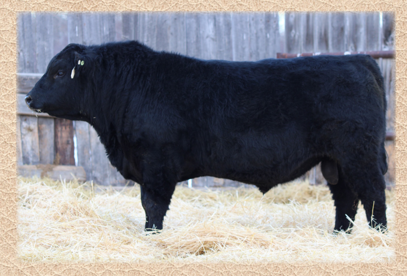
Lot 44 - FR COMPLETE 10G