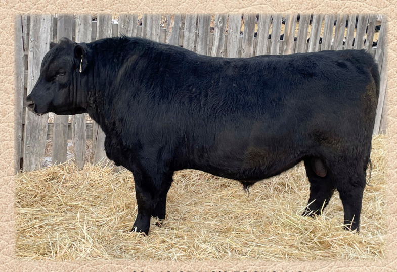
Lot 22 - JC CRAIG'S FOCUS 41G

For more information call DLMS: Mark Shologan 780.699.5082 or DLMS Purebred Team 780.991.3025