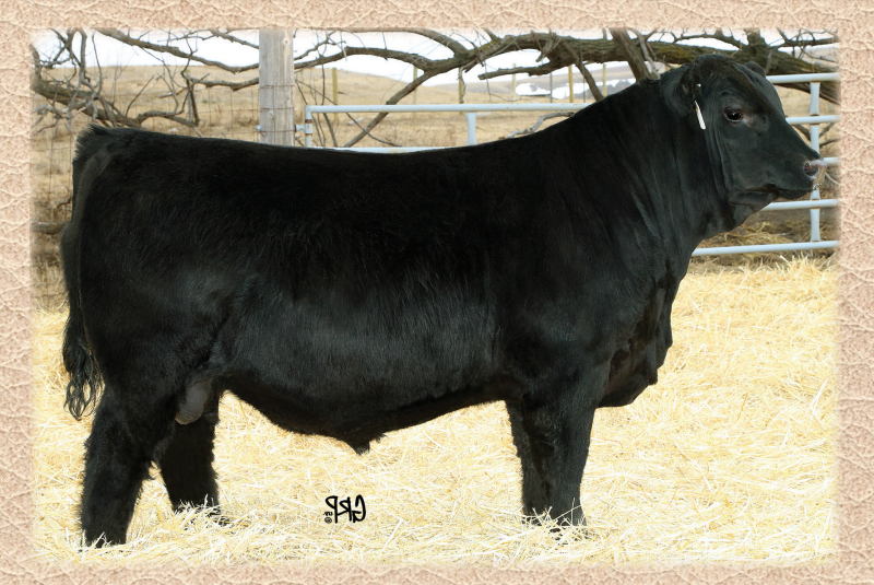
SIRE - SIX MILE CROSSFILE 376D