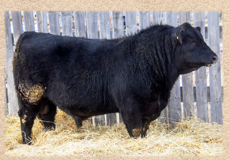
Lot 3 - JC CRAIG'S TENN X 38G