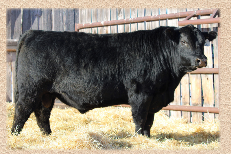
Lot 45 - FR COMPLETE 33G

His mother has been a great producer with desirable udder, feet, and leg traits. Compact in stature and well put together.