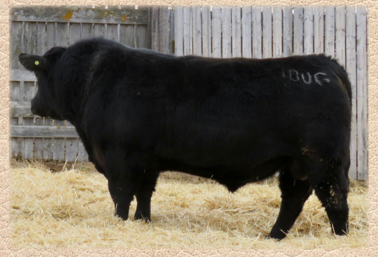
LOT 54 - BEAR CREEK JACKSON 100G

This bull has always been impressive, with an Elite mom who has never missed on bringing a top end calf to the bull or heifer pen. She's good footed and has a great udder. This bull is hard to pick a hole in; he is long, wide, and just all around great.