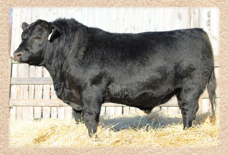
LOT 42 - FR COMPLETE 3G

This well put together bull is hard not to like. Quiet disposition, classic Angus head, wide base, and spectacular muscle definition.