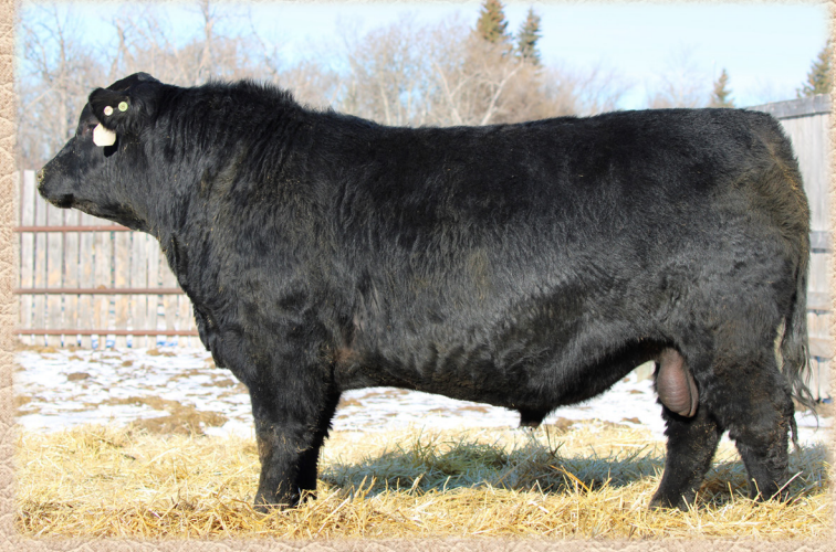
Lot 37 - FR CROSSFIRE 22G

They don't come any deeper or soggier than this top end bull. Nice head. Large capacity bull with a modest birthweight.