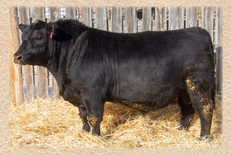
Lot 19 - SARAH'S FOCUS 3G