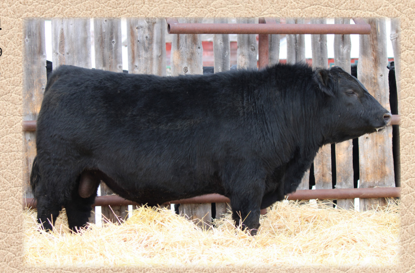
Lot 48 - FR COMPLETE 49G

Don't miss this top end bull. Quiet, excellent hair, heavy bone, thick framed, and muscled. He checks a lot of boxes for herd development.