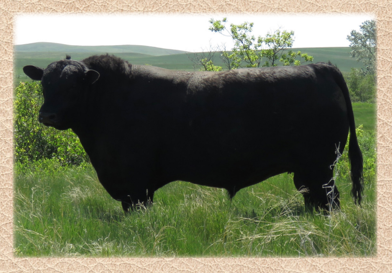
SIRE - EASTONDALE 6A WINDY 03'15