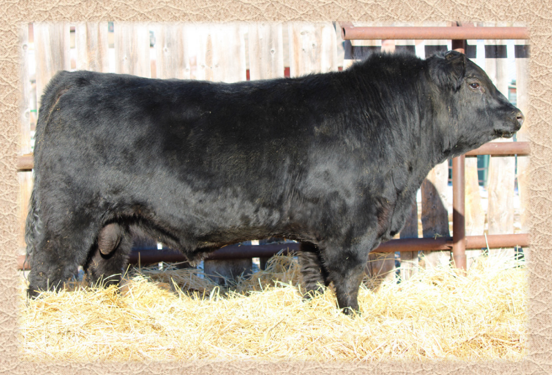
Lot 36 - CROSSFIRE 18G