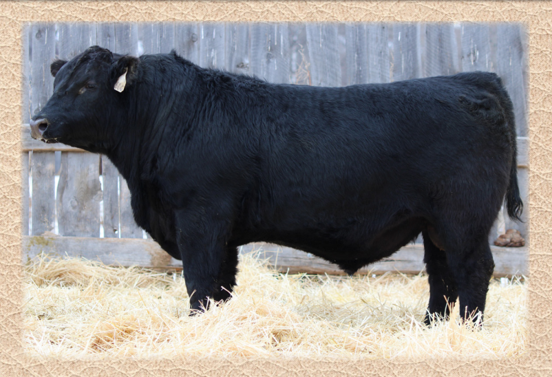
LOT 50 - FR COMPLETE 60G