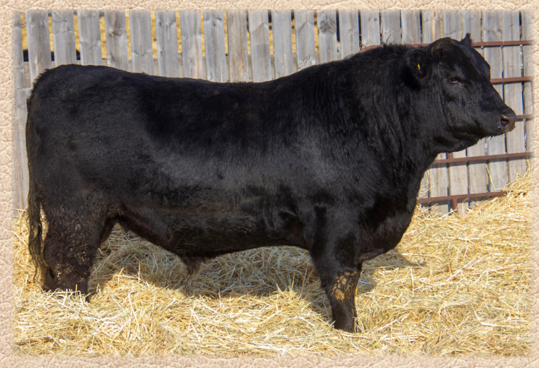
Lot 2 - JC CRAIG'S TENN X 33G