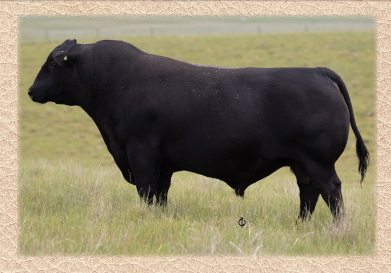
SIRE - BEAR CREEK STONEY 54D