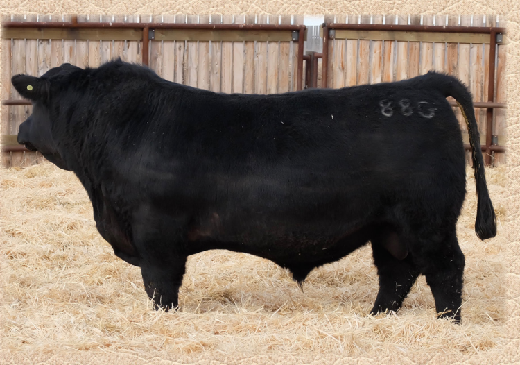
Lot 63 - BEAR CREEK STONY 88G

One of the most powerful Stoney Creek son's we have raised. This bull has extra length and muscle. Comes from a good-footed, good-uddered cow. Last year's maternal brother went to Black Creek Cattle Co.