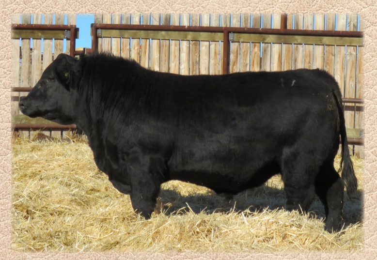
LOT 55 - BEAR CREEK JACKSON 90G

Goes back to my 796W cow that raised top bull after top bull and this guy really follows that legacy. He's long, thick, with big, good feet under him and a propensity to breed every cow he can find.