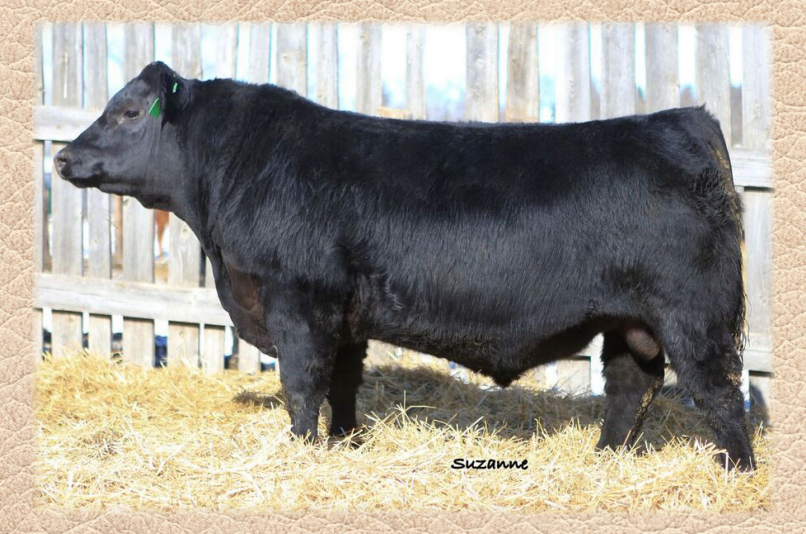
SIRE - BURNETT COMPLETE 21C

Due to injury this will be Complete's last offering of bulls. Outstanding eye appeal and good disposition. A consistent bull that has excellent structure. Well muscled, easy calving, and easy keeping. His heifers are feminine and fancy.