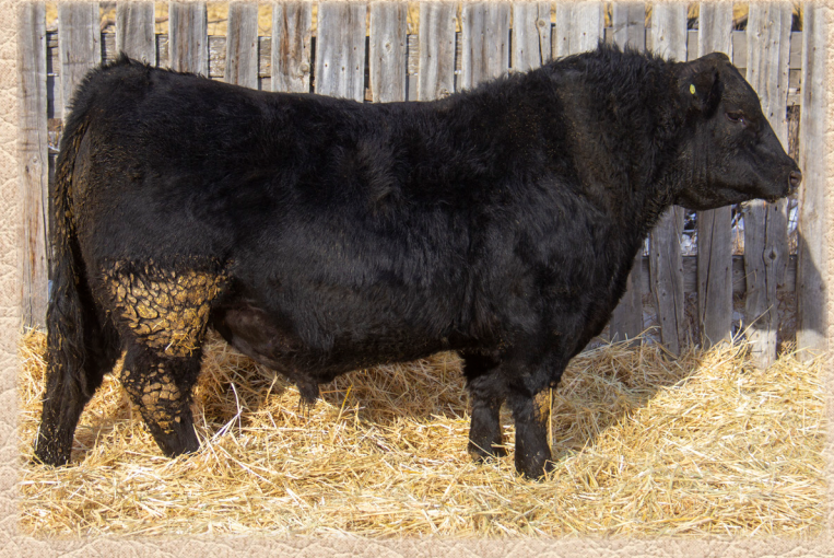
Lot 1 - JC CRAIG'S TENN X 26G