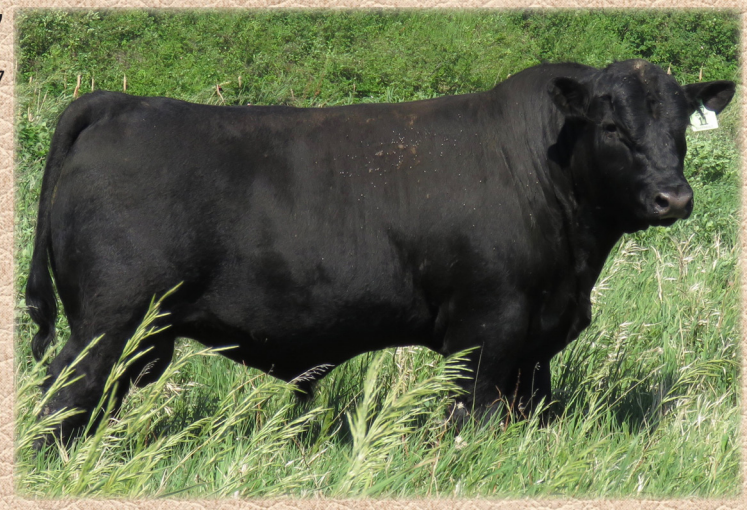
SIRE - EASTONDALE REFLECTION 57'17

Reflection is a young herd sire from Eastondale Angus. He's a nice, balanced, hard muscled bull with the ability to breed a lot of cows. I think he's only had one dry cow in his field in the first two years of breeding him.