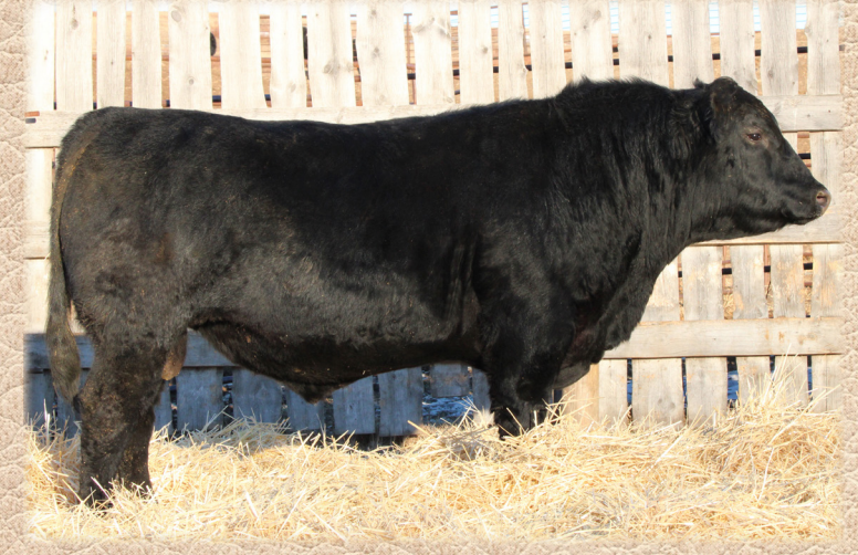
Lot 32 - FR MOMENTUM 37G

He is a moderate framed, smooth shoulder bull with good feet and leg quality. Classic Angus head and quiet nature.