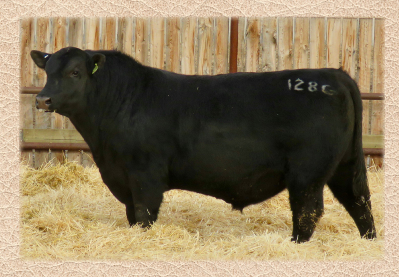
Lot 73 - BEAR CREEK ROCKY 128G