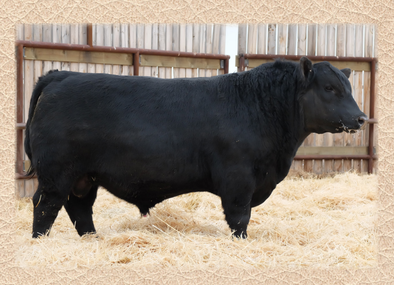
Lot 74 - BEAR CREEK ROCKY 38G