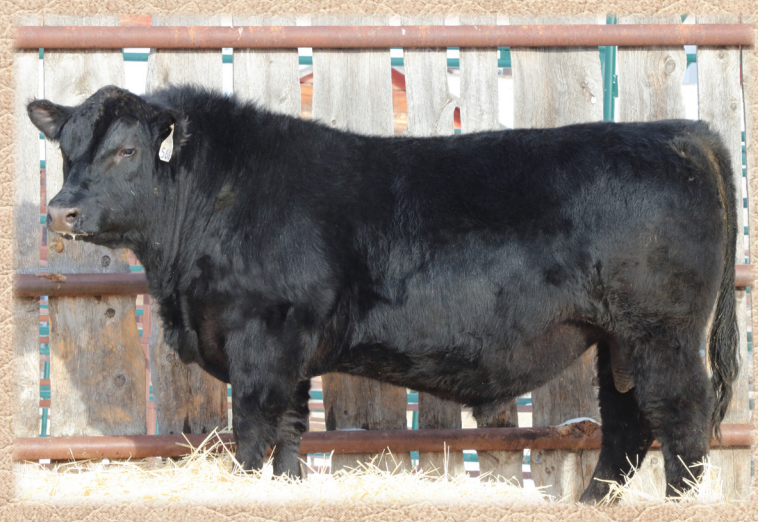
Lot 49 - FR COMPLETE 56U

The maternal side brings longevity and productivity to this offering. Lots of length and growth.