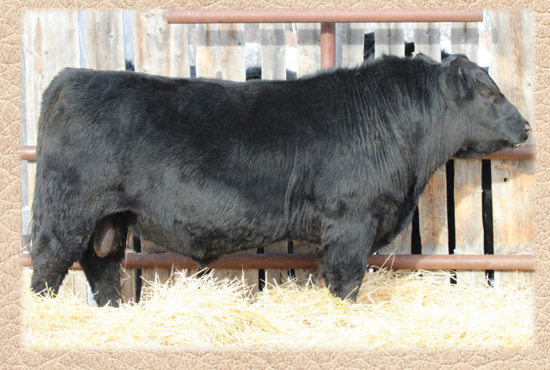
Lot 47 - FR COMPLETE 47G

This boy has a great herd bull look to him. Very quiet nature and classic Angus traits.